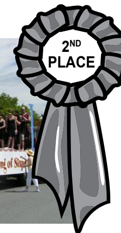
Class of 1999 ~ Sing a Song of Sixpence