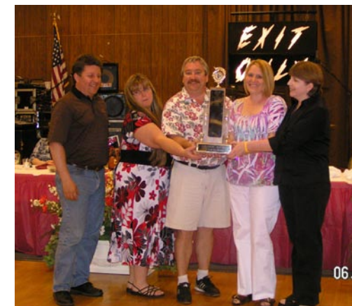
Class of 1979 ~ Humpty Dumpty