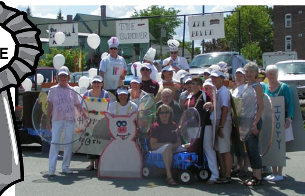
Class of 1969 ~ Rub-A-Dub-Dub